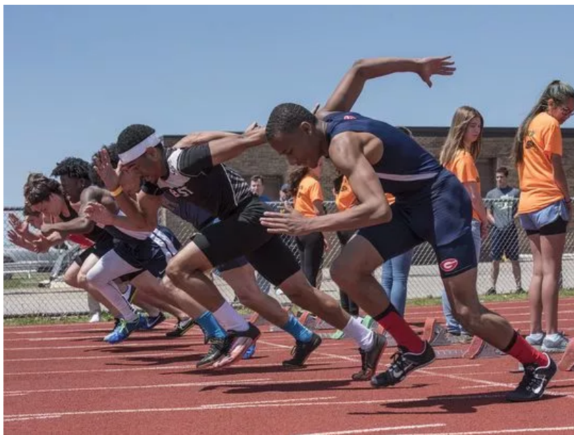
Participants in the 100-meter dash preliminary heat swing into action.

“We had a bunch of guys get through to the finals in the 100 and 200, Dash (Dobar) ran an outstanding race in the 800 (first with a time of 1:58.53). Some of the teams that were ahead of us today we won’t see at the regional next week. So I think we have a really great chance as a team to score high at that meet.”